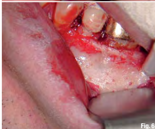
Fig. 6 The retractor is placed into a prepared groove on the cortical plate stability to prevent tissue impingement.

coronal) movement within the unattached gingival portion of the flap. Maintaining the same motion, the instrument is moved slowly towards the same apical position at the more distal extent of the flap. The working end of the elevator should be sharp so that the reflection will be a dissecting process, thus crushing or tearing of the tissue is avoided.