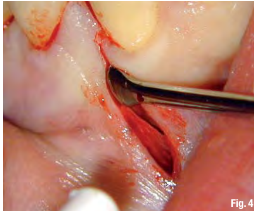
Fig. 4 The Molt, or Ruddle elevator, is inserted into the unattached gingival portion of vertical releasing incision.

The reflection of the flap is accomplished using the Molt, Ruddle R, or Ruddle L (SybronEndo) periosteal elevators. The working end of the instrument is gently inserted into the releasing incision, line into the free gingival tissue apical to the muco-gingival attachment and as far apically as the incision and bony contours will gently permit (Fig. 4). The instrument is manipulated in a gentle up-and-down (apical-to-