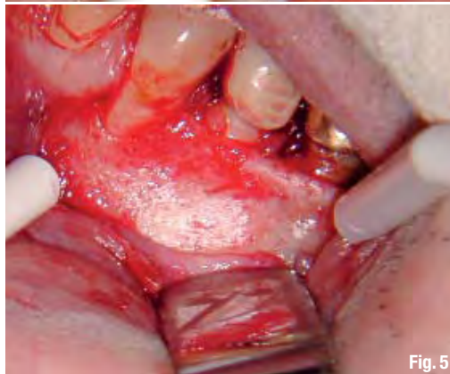
Fig. 5 Tissue impingement by the retractor is the leading cause of post-operative discomfort.